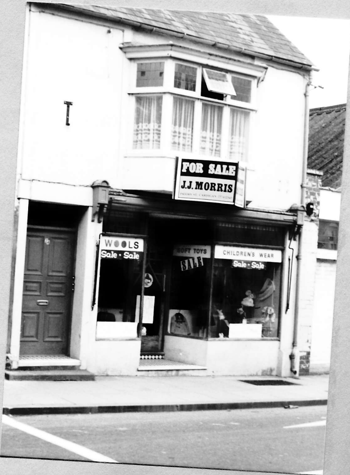
34 Pendre Cardigan (1982)