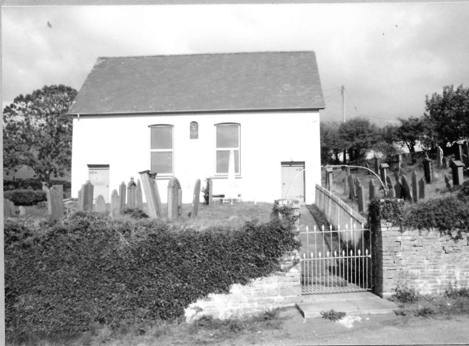
SILOAM, Ferwig: the Jenkins graves are grouped in the top right corner of the picture.