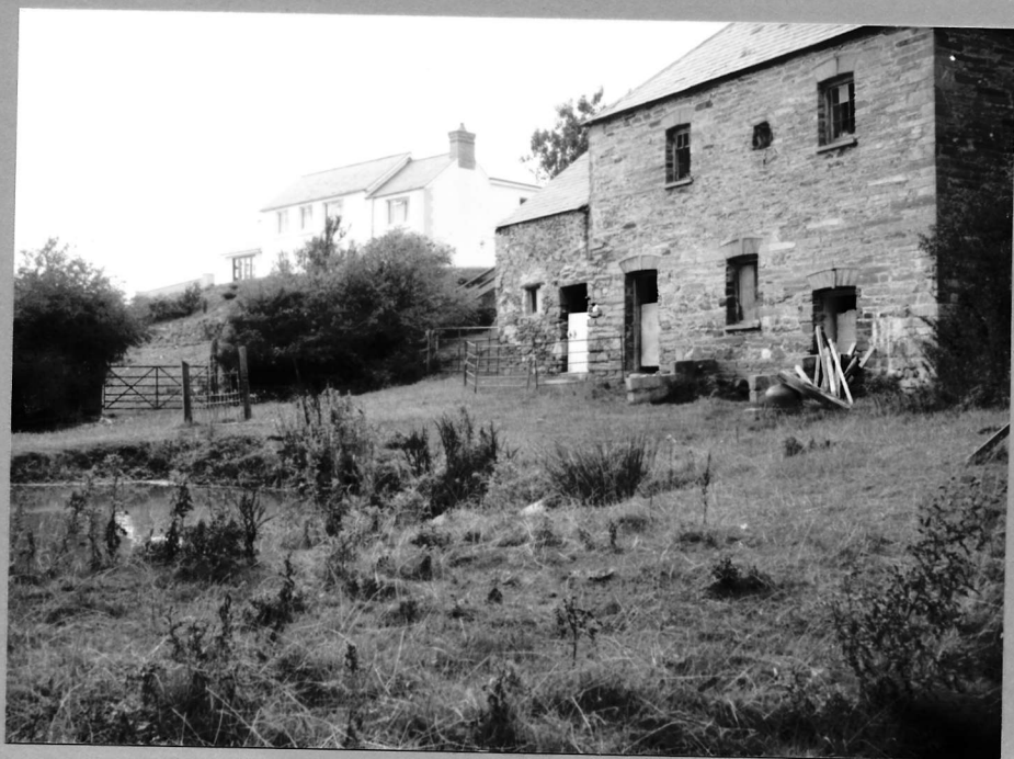
The derelict mill at Felinbedr, Ferwig. The white house in the distance is on the site of the old miller's house. I was told that the mill will also be restored in due time.