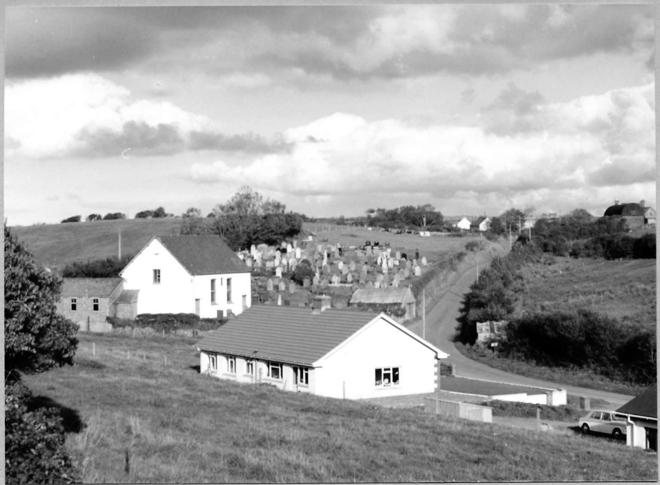
SILOAM Baptist chapel Ferwig